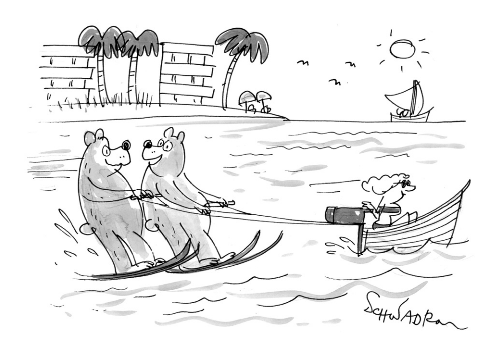
"And you wanted to hibernate!"